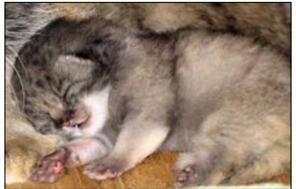
Pallas' cat baby at three weeks old.