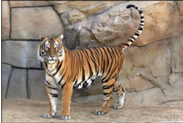
Tiga the Malayan Tiger

The funds raised allow EFBC's Feline Conservation Center to continue expansion of breeding areas