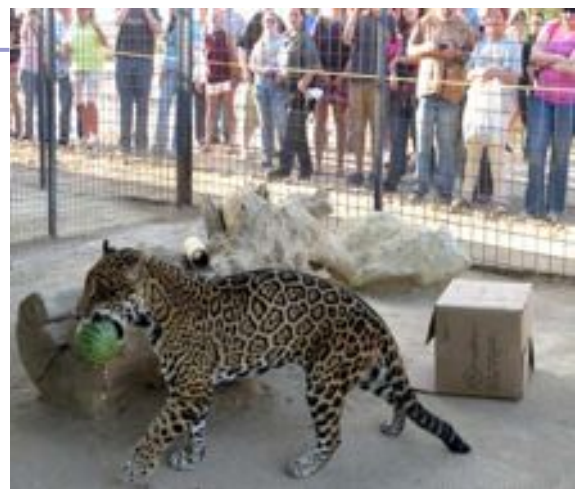
Spring Twilight Tour attendees watch Poncho the Jaguar carry away his watermelon enrichment.

The WCS survey in Guatemala is utilizing 50 stations of paired camera traps covering a 500-square kilometer area of community-managed forest to study the jaguar.