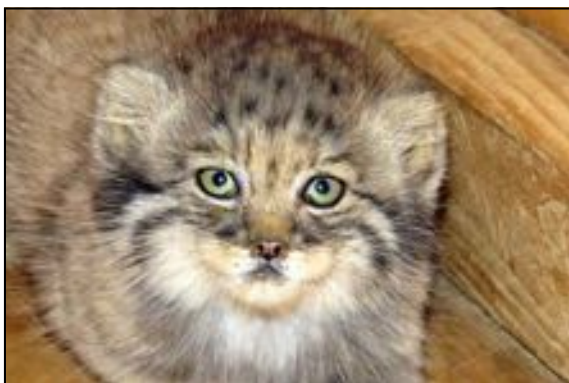
One of the males at 7 weeks old.

Along with these threats, Pallas' cats born in captivity are highly susceptible to toxoplasmosis, which compromises a viable population. The newborn mortality rate is around 60%. It