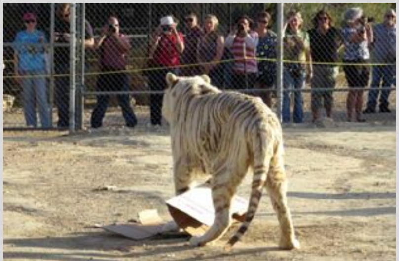
Katmandu smashes a big box during the spring Twilight Tour.

Tickets can be purchased by calling (661) 256-3793 between 10 a.m. and 4 p.m. or on the day of the tour. Advanced ticket purchase allows guests to arrive a half-hour early. Doors open at 5:30 p.m. for tickets purchased at the door.