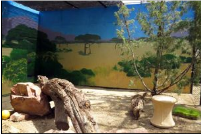
Obi the Serval (right foreground) enjoys his newly upgraded cage.