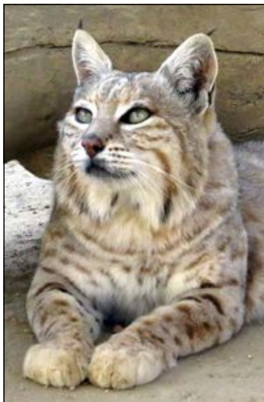
Willow the bobcat.