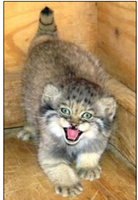
A feisty Pallas' cat baby at 7 weeks.

The areas these cats are found include: Afghanistan; Armenia; Azerbaijan; China; India; Iran, Islamic Republic of; Kazakhstan; Kyrgyzstan; Mongolia; Pakistan; Rus-