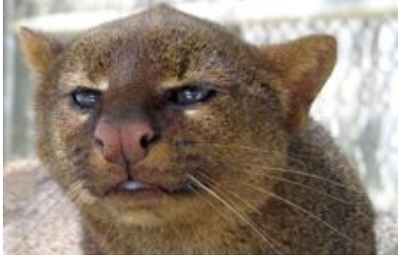
Maya the Jaguarundi