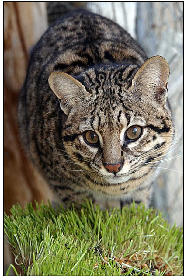
Xeno is a 12-year-old the Geoffroy's Cat.

Their status and decreasing population is due to heavy commercial hunting of the species from the 1960s to the late 1980s, with nearly 350,000 skins exported from Argentina alone between 1976 and 1979. Trade volumes remained high into the 1980s as trade in ocelot pelts declined, averaging 55,000 per year from 1980-1984. Paraguay and Bolivia were the main exporters (in contravention of national legislation) during this time, although it is believed that the bulk of these skins were smuggled in from Brazil and Argentina. International trade has since declined - no significant trade has been reported since 1988.