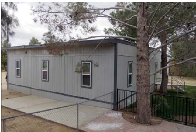
The exterior of our new modular office.

style housing unit for interns. As indicated in the Donations section (see page 2), we are seeking donations to our general fund to assist in the upgrade to the unit. Each year, EFBC-FCC hosts interns from around the world. The new dormitory is much-needed and will provide comfortable housing for our student guests.