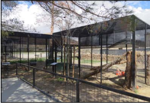
The new enclosures located in "The L."

Recently, we moved our Jaguarundi sisters, Maya and Aztec, as well as Willow the Bobcat back into new enclosures. The two new enclosures are upgrades to the ones these cats were housed in previously in the same area.