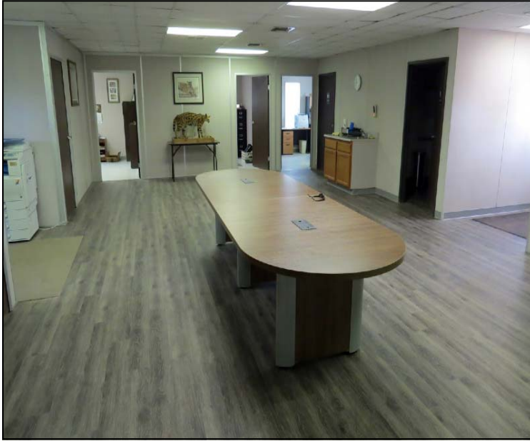
The main area of the office features a large conference space that will be used for regular meetings of EFBC staff, volunteers, and directors..

After years of staff working out of two donated mobile home trailers, EFBC-FCC now has a new modular office space!