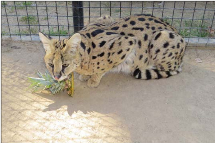
Obi the Serval enjoys a pineapple!