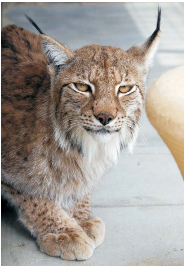
Assar is a handsome gent.

and large feet which provide a “snowshoe effect”, allowing for more efficient travel through deep snow. In winter, the fur grows very densely on the