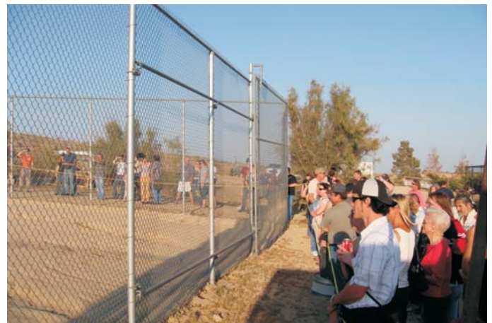
Guests look on as our tiger Caesar goes for an evening stroll.

The entry fee is $15. These events are for adults 18 and over only. Those that pre-pay for these events may come in at 5PM. Entry for same night admissions begins at 5:30PM.