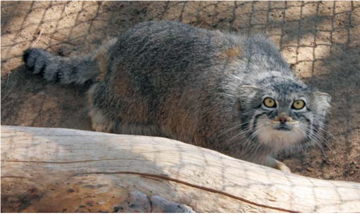
There have been no new births to report this year of the Pallas' cat.