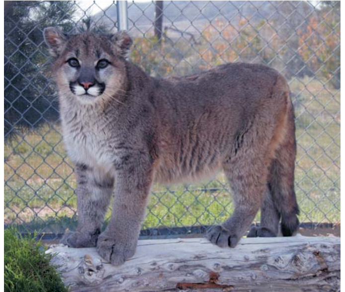
While not on display right now, Oranda, who was found orphaned in Washington State, is a gorgeous Puma that is enjoying her space in a secluded back area.

Indian zoos have bred tigers since 1880, with the first successful attempt occurring at Alipore Zoo in Calcutta. Since then the Bengal tiger has bred freely in captivity. It has reached the stage where contraceptives are needed to prevent an excess of captive tigers, for which adequate facilities may not be available. The 1994 International Tiger Studbook listed 333 captive Bengal tigers. One of these, one tigress, was in a North American zoo, while the rest were within India.