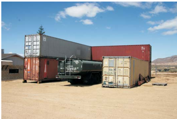
Using the containers as walls, we will soon have a covered area to work on vehicles, make den boxes, and do other projects.

Shipping containers have added a valuable new area to the facility, and the storage areas they provide will be utilized fully.