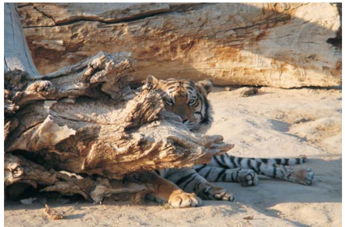
Caesar looks out from the safety of his logs as the sun sets.

Also, an area of interest will be a study on how tigers and snow leopards are affecting each other. "The worst case scenario will be the bigger tiger going higher and minusing (sic) out the smaller snow leopard, since they don't tolerate other predators in their area, but generally we