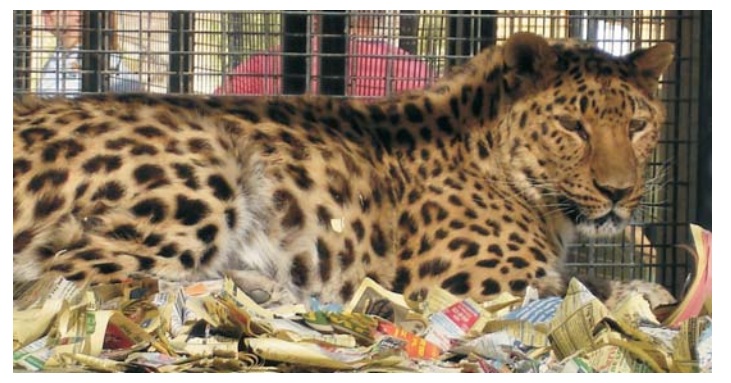
Masha, (Amur leopard) enjoyed her toy at the last Twilight Tour. Thank you for all who donated phone books but please do not bring any more, we have enough to last for many years.