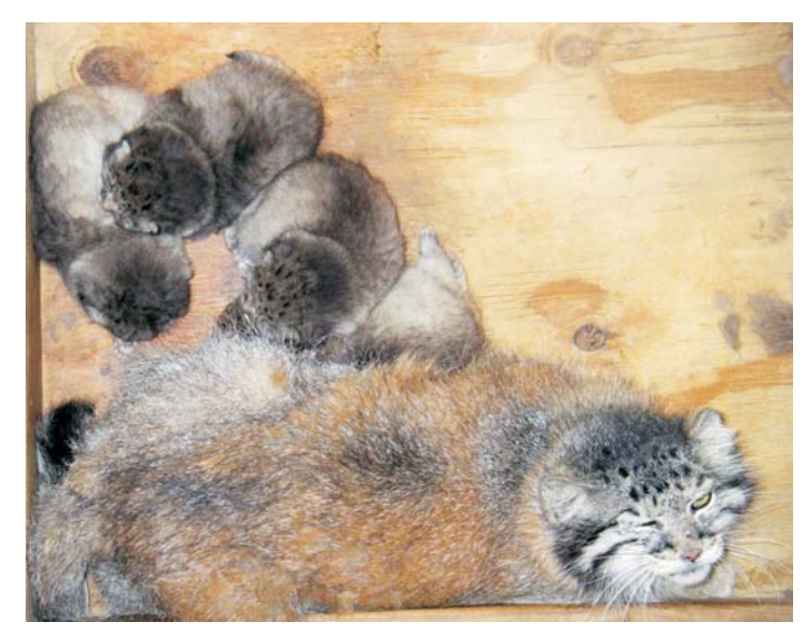
Princess and kittens at 3 weeks. See them on our web cam, follow the link on our home page.

are difficult to discern, but it is feared that they are in rapid decline. Encroaching human populations have waged war on the rodent like Pika, the main prey species of this cat. Poison kills up the food chain. One of the only indicators of how well these animals are doing in the wild comes from the fur trade.