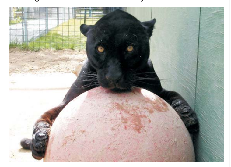
Doc, Twilight's son, plays with a Boomer ball.

are not safe enrichments for a cat with this kind of power. Finding institutions capable of housing these great felines is also always difficult.