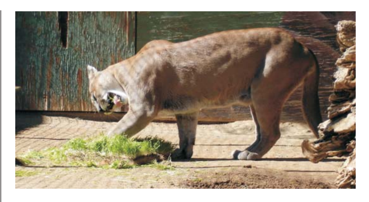
Teddy enjoys a flat of wheatgrass brought up on most Sundays for him. Robek's Juice in Burbank donates these discards as enrichments for many of the cats.

EFBC sincerely appreciates the wonderful support of all those people who donated items for our Big Cat Bazaar, cleaning supplies, cat enrichment items, maintenance materials, and items for our Twilight Tour raffles and Follies silent auction. Unfortunately limited space in our newsletter prevents us from listing all your names, but please know your donations mean a lot to us and we thank you.