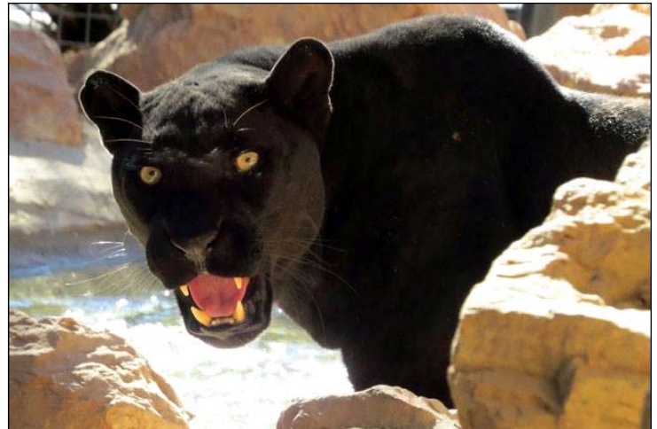
Tran the black Asian leopard recently had his 17th birthday.

Another misconception is that the cats are all black. But they are dark brown, with the same pattern of black spots as any other leopard. There are no solid black big cats.