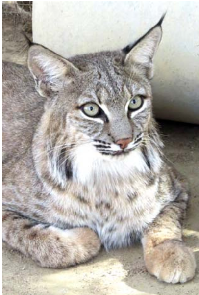
Species-specific strains of FIV have been found in some non-domestic cats, including bobcat.

A high prevalence of FIV has been found in many populations of wild cats, including African lions and bobcats and pumas of the Western United States. Wild cats typically remain asymptomatic and do not show the same clinical signs of a compromised immune system as do domestic cats. Because FIV is so endemic in many populations of wild cats, such as the lions in Serengeti, when they become infected with other diseases, it is difficult to determine what role, if any, FIV plays in the disease process since there are very few FIV-negative cats to compare. It has been determined that if a cat of one species is infected by a strain of FIV from another species, there is greater risk of clinical disease.