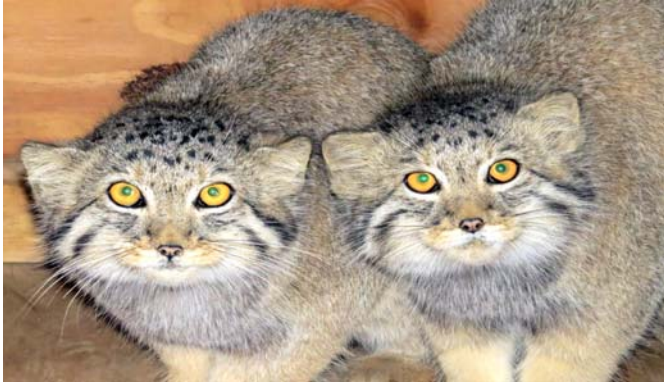
Pallas' cats Garab and Yeshi (born March 2013).