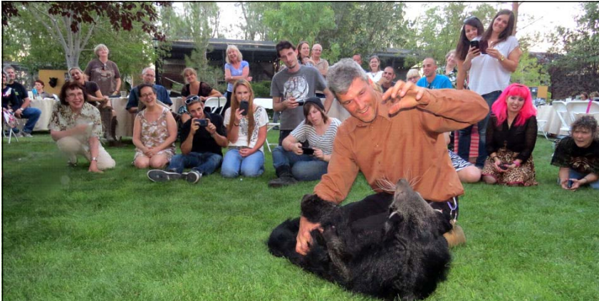
Working Wildlife brought out several animals, including this Binturong from Southeast Asia.