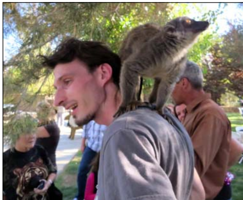
Conservation Ambassadors introduced their brown lemur to guests.