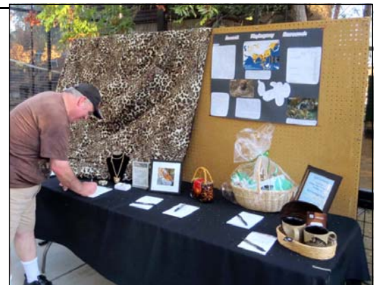
The silent auction consisting of unique and cat-themed items, is always a highlight.

We would like to thank all our sponsors, auction donors and attendees who supported this yearly event.