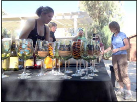
Guests could enjoy their favorite beverage in a special hand-painted cat-themed glass.