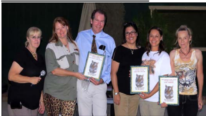
Thanks to our sponsors for helping make the evening great!

This year's theme was "Tigers: Disappearing in the Wild," in honor of the completion of our Project Tiger. After several years of dormancy, EFBC-FCC's breeding program focusing on endangered tigers has started up again with the arrival of Tiga, a male Malayan tiger. This endangered cat was only recently recognized as one of the few remaining subspecies of tigers and our hope is to bring in a female for him to breed with, produce offspring and raise the numbers of these cats in existence.