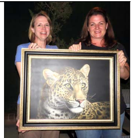
This scratch board of Sakhar was a top live auction item.