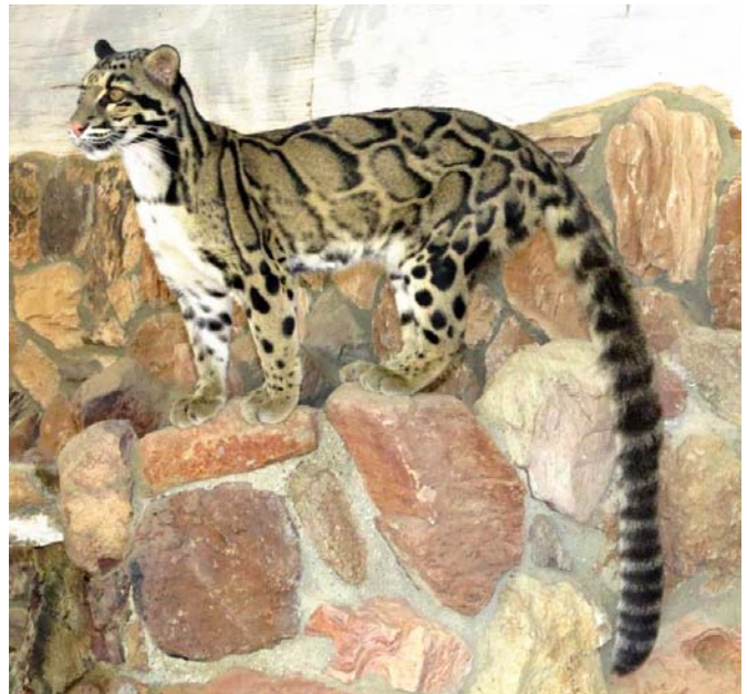
The presence of six felid species, including the Clouded Leopard (pictured, above is EFBC's Kyoke), were found during the course of the study.

A total of 17 wild mammal species were recorded through the camera trappings, sightings, track prints, calls, scat/pellet findings and interviews with locals. Of the 17 mammal species, three felid species were recorded: clouded leopard, Indian leopard and leopard cat.